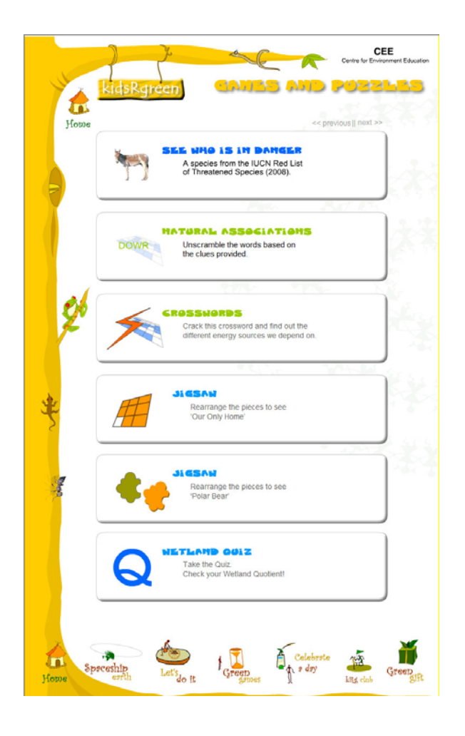
Figure 3: Environmental Games on kidsRgreen