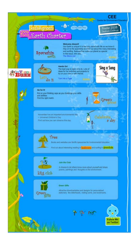
Figure 2 : Homepage of kidsRgreen

Autonomous use of computers essentially implied that children were most commonly using it to play games or maybe use paintbrush. This gave the clue make games as an important methodology for learning through the website. The play factor became the anchor for the site. Games with messages that included positive environmental behaviours (for example, learning to recognize and sort garbage as that which degrades and that which won't) were designed. For children, games were a natural way of using computers; the environmental messages entwined in games were a strategy to bring about shifts in attitudes and individual or collective action, (an important goal of EE). In regular feedback obtained from users, the Green Games section has been the most popular section of the website.