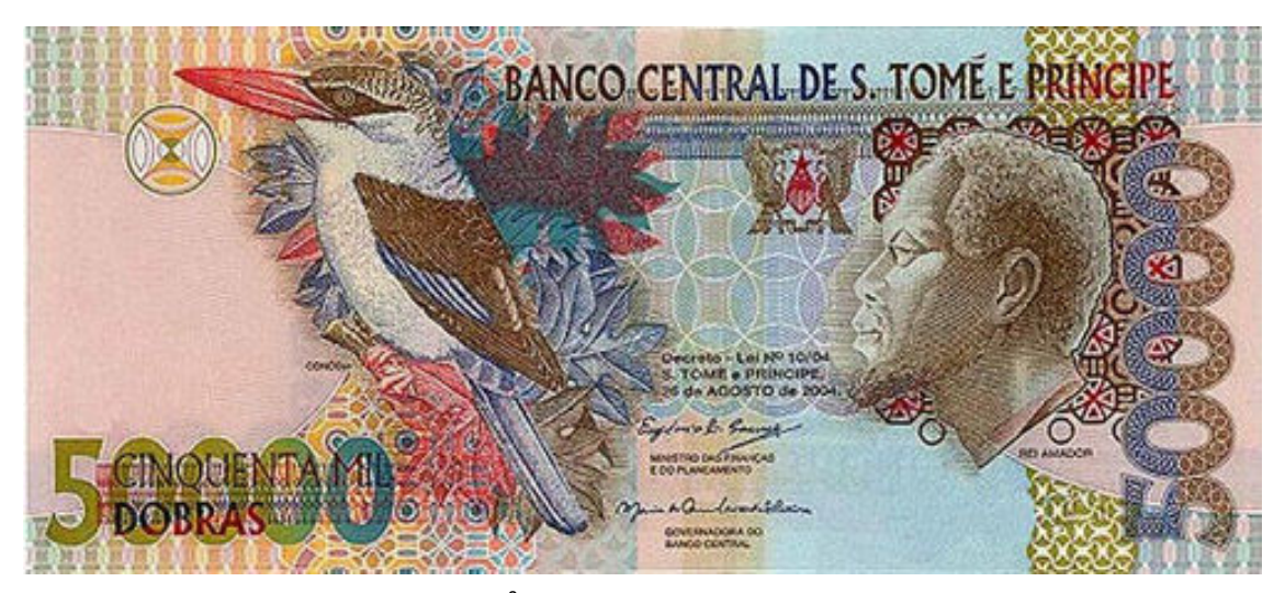
Figure 2. Sao Tome & Principe (Dobras) 8

adolescents. It can tell a full story to the child who possess it. This is a classic example of how a banknote can cater also to child user segment.