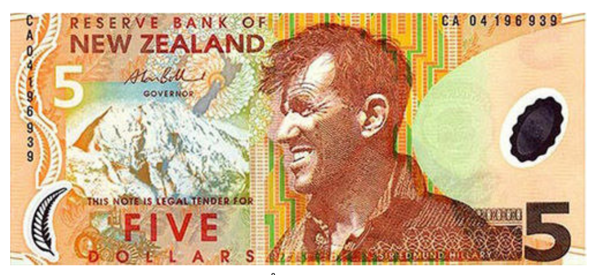
Figure 3. New Zealand (New Zealand Dollars) <sup>8</sup>

This is a good specimen of excellent aesthetics and unbelievable use of colours in an otherwise such an orthodox product. It has many of the elements of interest for the adolescent users of money but all in a high denomination banknote. All these presented with excellent features of security and functionality for a classic security document.