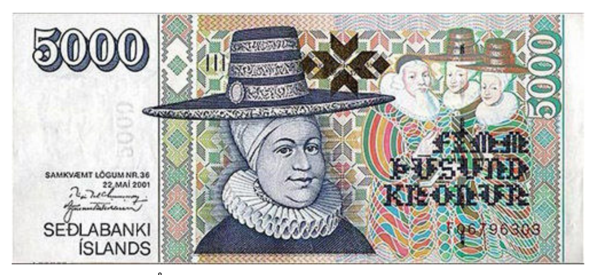
Figure.4 Iceland (Kronurs)8

the children and educate them. In fact this banknote can inspire the children and make them aspire to be an achiever as is the person on the portrait in an emphatic manner.