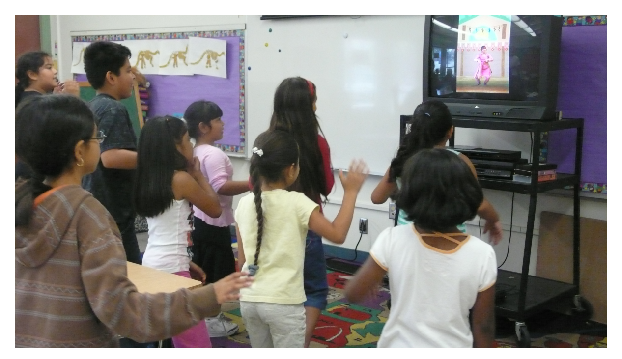
Figure 3: Focus group at Betty Plasencia elementary school, Los Angeles, USA

The content was shown to kids in a focus group assembled at Betty Plasencia elementary school, Los Angeles, California. The children in the focus group were predominantly of the Latin origin. They were shown a video of Haba's travel to India and exposed to music and dance that was different from their own. The children showed enthusiasm not only in following the steps of the dance and learning about India but also in the stories of Haba's other expeditions. Their curiosity to see Haba in different countries like Africa and Australia and Thailand shows great potential in the program. They were excited to learn a new language and learn about a foreign land. It was this curiosity that will help them retain what they learn better and open their mind and perception to new things. One of the highlights was when a kid asked me if Haba could take them to Timbuktu!