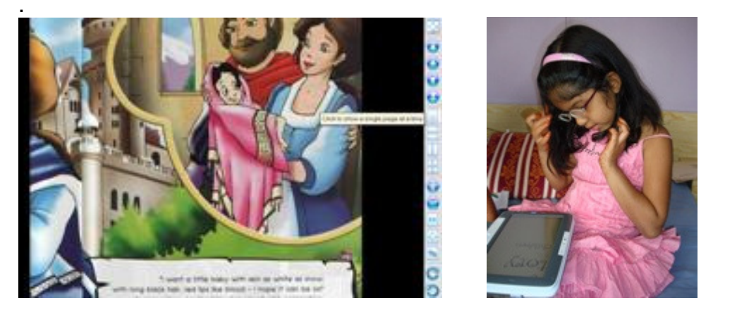
Figure.6 Reading applications where the image gets cropped while zooming into text.

On the hardware side, there are a few important elements, which need to be continuously improved as technology matures and costs drop. These include touch capability which must be excellent quality and allow for light finger touch to permit gestures like sweeping pages for page turn, hitting hyper linking with a simple touch on the screen. Kinetic interaction with digital content is the key for adoption and ability of the digital content to create an emotional connection with the learner. Further, providing reading specific features and affordance such as a scroll buttons or home buttons will enhance the reading experience.