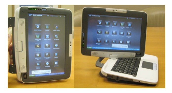
Figure.1 Classmate PC, Intel Learning Series convertible tablet reference design with touch screen

Intel Corporation in collaboration with network local computer manufacturers and software partners are exploring design and development of low cost and purpose built PCs bundled with software to improve learning experiences in the classrooms/home that has traditionally been analog. Key characteristics include touch screen, writing on screen, rotational camera, accelerometer (senses physical motion of the tablet PC), small size, handle and design affordances for many flexible-holds. Based on observational design research in 1:1 eLearning settings, these features are designed to enhance learning experiences of children above general purpose built PCs [7]. These address key gaps observed in student computer use and migrate these activities from paper to digital media. The form factor and technology components are optimized for seamless reading/ interaction with e-books, writing/drawing (Fig 1). This study highlights a single example of observational research and design effort leading (in this case in collaboration with Human Factors International) to continuous optimization of classmate PC for educational activities.