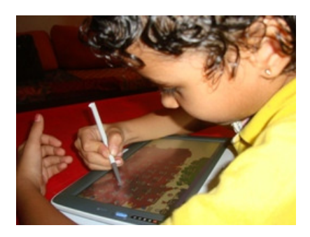
Figure.10 Participant (7 years) trying to find one of the drawings she made on the CMPC