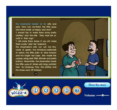
Figure.2Interactive e-book with audio and animation